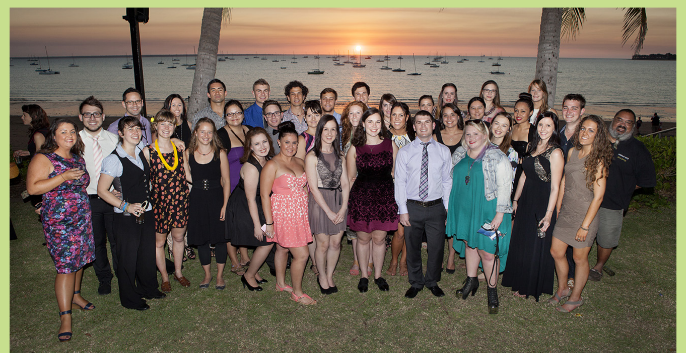
Student and Community Bursary Recipients at LIME Connection V in Darwin 2013.

"The whole event was very inspiring and being around Indigenous people throughout the world was a major highlight. The connection has made me more passionate to undertake further studies in the field of Indigenous health"